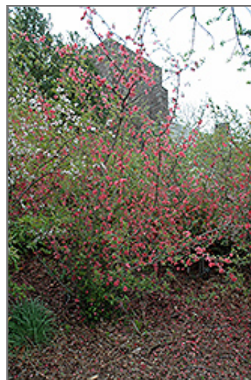
Pink Lady Flowering Quince in bloom