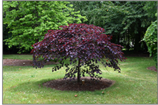
Ruby Falls Redbud

Ruby Falls Redbud will grow to be about 8 feet tall at maturity, with a spread of 6 feet. It has a low canopy with a typical clearance of 1 foot from the ground, and is suitable for planting under power lines. It grows at a medium rate, and under ideal conditions can be expected to live for 60 years or more.