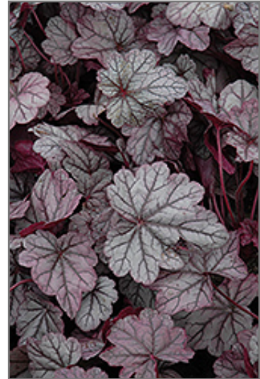
Carnival Sugar Plum Coral Bells foliage

This is a relatively low maintenance plant, and should be cut back in late fall in preparation for winter. It is a good choice for attracting hummingbirds to your yard. It has no significant negative characteristics.