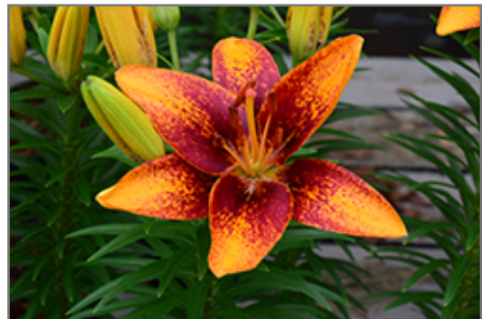
Lily Looks Tiny Orange Sensation Lily flowers