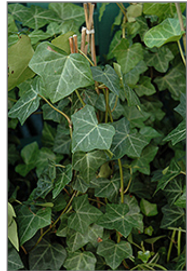
Thorndale Ivy foliage