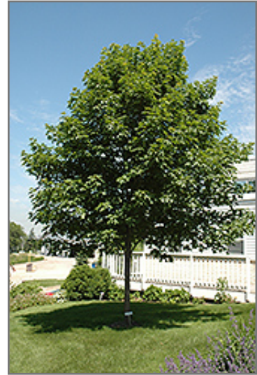
Fall Fiesta Sugar Maple

This tree should only be grown in full sunlight. It prefers to grow in average to moist conditions, and shouldn't be allowed to dry out. It is not particular as to soil pH, but grows best in rich soils. It is somewhat tolerant of urban pollution. This is a selection of a native North American species.