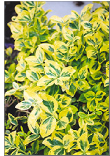
Sungold Wintercreeper foliage