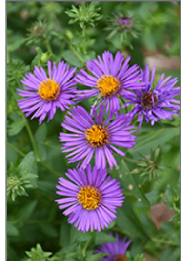
Purple Beauty Aster flowers