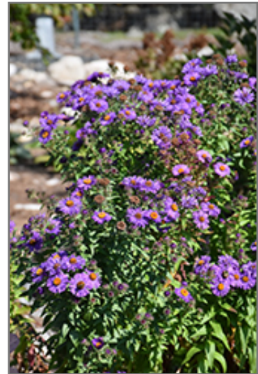
Purple Beauty Aster flowers

This plant does best in full sun to partial shade. It prefers to grow in average to moist conditions, and shouldn't be allowed to dry out. It is not particular as to soil type or pH. It is somewhat tolerant of urban pollution. This is a selection of a native North American species. It can be propagated by division; however, as a cultivated variety, be aware that it may be subject to certain restrictions or prohibitions on propagation.