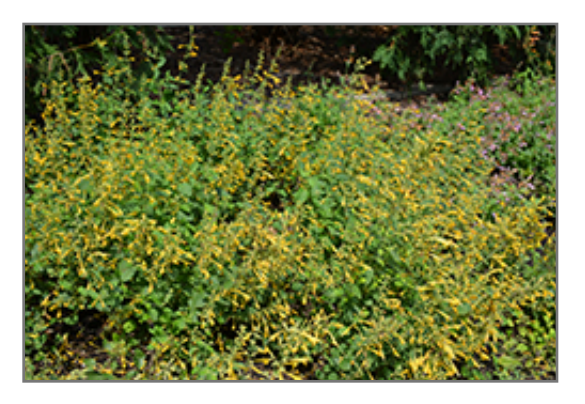
Arizona Sun Hyssop in bloom

Arizona Sun Hyssop is recommended for the following landscape applications;