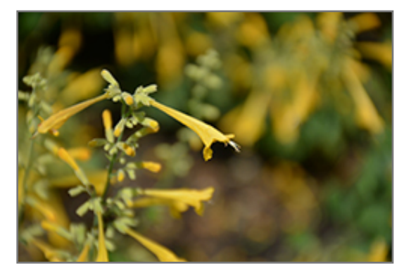
Arizona Sun Hyssop flowers