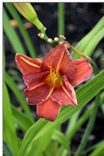
Chicago Ruby Daylily flowers