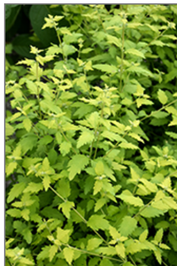
Sunshine Blue II Caryopteris foliage

Sunshine Blue II Caryopteris makes a fine choice for the outdoor landscape, but it is also well-suited for use in outdoor pots and containers. With its upright habit of growth, it is best suited for use as a 'thriller' in the 'spiller-thriller-filler' container combination; plant it near the center of the pot, surrounded by smaller plants and those that spill over the edges. It is even sizeable enough that it can be grown alone in a suitable container. Note that when grown in a container, it may not perform exactly as indicated on the tag - this is to be expected. Also note that when growing plants in outdoor containers and baskets, they may require more frequent waterings than they would in the yard or garden.