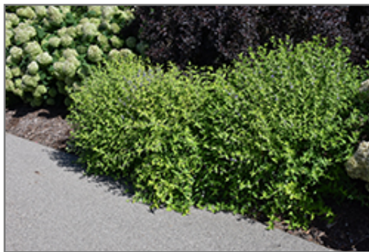
Sunshine Blue II Caryopteris in bloom