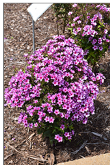
Early Purple Pink Eye Garden Phlox in bloom