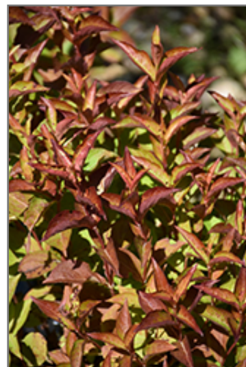
Date Night Strobe Weigela foliage