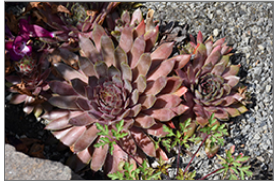
Kalinda Hens And Chicks

Kalinda Hens And Chicks is recommended for the following landscape applications;