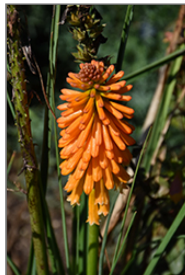
Pyromania Orange Blaze Torchlily flowers

An excellent, compact, re-blooming variety with an upright habit and stunning flame orange flower stalks, creating an unusual border or container planting; makes a great cutflower and attracts hummingbirds