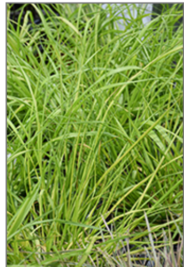
Prairie Winds Lemon Squeeze Fountain Grass foliage