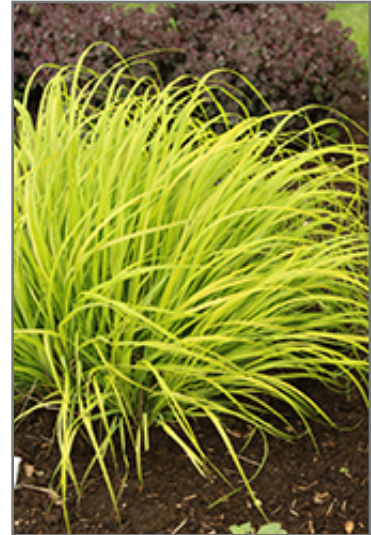
Prairie Winds Lemon Squeeze Fountain Grass

Prairie Winds Lemon Squeeze Fountain Grass is recommended for the following landscape applications;