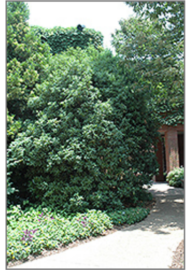
Long-leaved Laurel

This tree does best in full sun to partial shade. It prefers to grow in average to moist conditions, and shouldn't be allowed to dry out. It is not particular as to soil type or pH. It is somewhat tolerant of urban pollution. This species is not originally from North America.