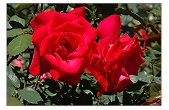
Timeless Rose flowers