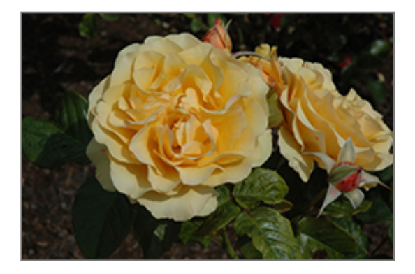
Amber Queen Rose flowers