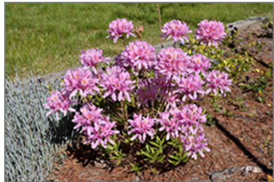
Orchid Lights Azalea in bloom