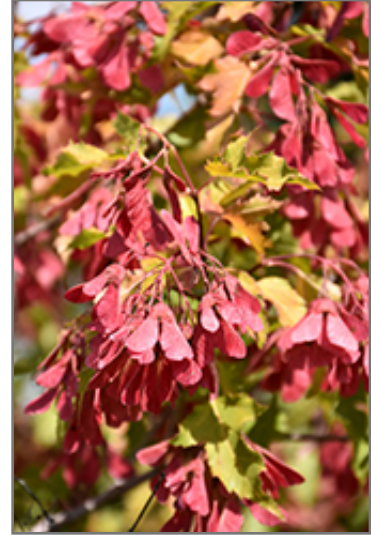
Amur Maple (tree form) fruit

This tree does best in full sun to partial shade. It is very adaptable to both dry and moist locations, and should do just fine under average home landscape conditions. It is not particular as to soil type or pH. It is highly tolerant of urban pollution and will even thrive in inner city environments. This is a selected variety of a species not originally from North America.