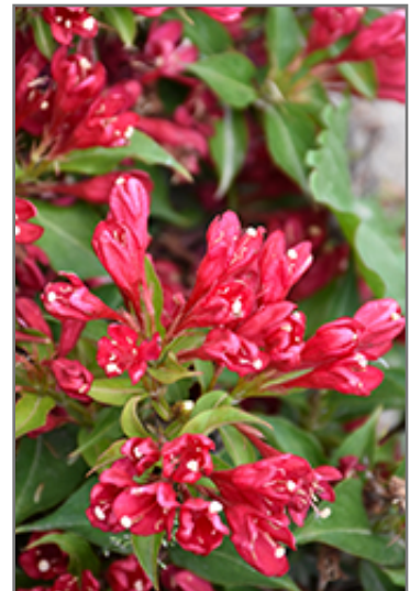
Crimson Kisses Weigela flowers