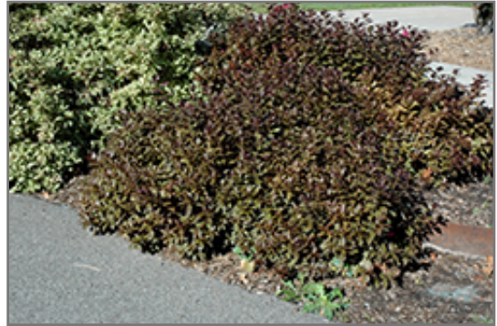
Minor Black Weigela

Minor Black Weigela makes a fine choice for the outdoor landscape, but it is also well-suited for use in outdoor pots and containers. Because of its height, it is often used as a 'thriller' in the 'spiller-thriller-filler' container combination; plant it near the center of the pot, surrounded by smaller plants and those that spill over the edges. It is even sizeable enough that it can be grown alone in a suitable container. Note that when grown in a container, it may not perform exactly as indicated on the tag - this is to be expected. Also note that when growing plants in outdoor containers and baskets, they may require more frequent waterings than they would in the yard or garden.