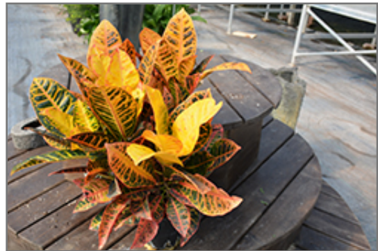
Variegated Croton