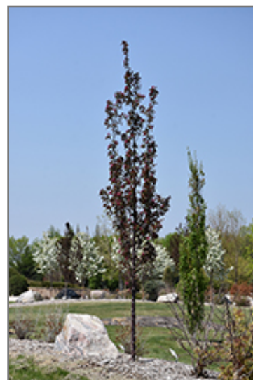
Royal Mist Flowering Crab in bloom