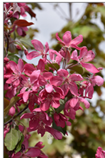
Royal Mist Flowering Crab flowers

Royal Mist Flowering Crab is recommended for the following landscape applications;