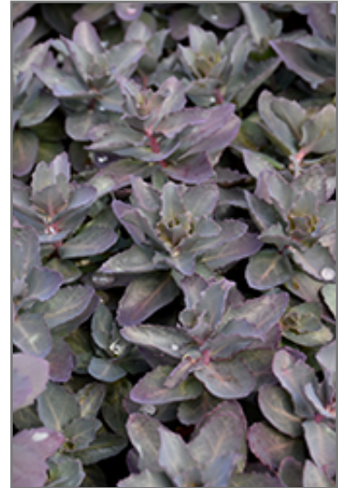
Cherry Truffle Stonecrop foliage

Cherry Truffle Stonecrop is a fine choice for the garden, but it is also a good selection for planting in outdoor pots and containers. It is often used as a 'filler' in the 'spiller-thriller-filler' container combination, providing a mass of flowers and foliage against which the larger thriller plants stand out. Note that when growing plants in outdoor containers and baskets, they may require more frequent waterings than they would in the yard or garden.