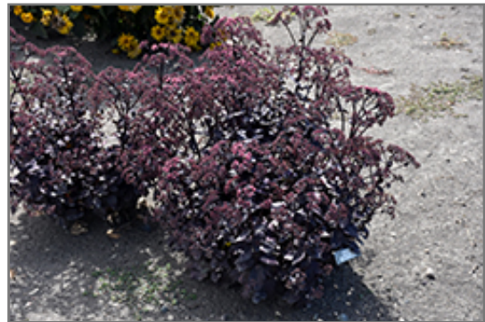
Cherry Truffle Stonecrop in bloom