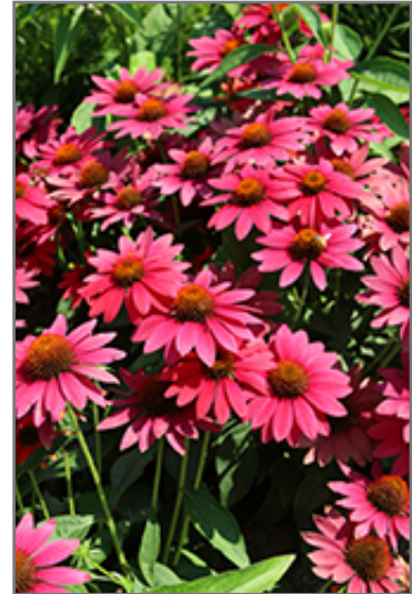
Sombrero Tres Amigos Coneflower flowers

This is a relatively low maintenance plant, and is best cleaned up in early spring before it resumes active growth for the season. It is a good choice for attracting butterflies to your yard, but is not particularly attractive to deer who tend to leave it alone in favor of tastier treats. It has no significant negative characteristics.