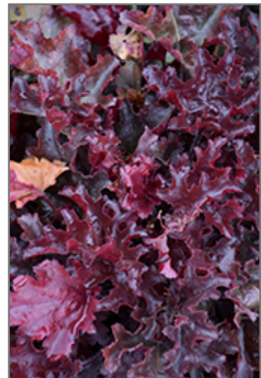
Dolce Cherry Truffles Coral Bells foliage