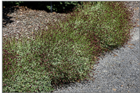
Little Angel Burnet in bloom