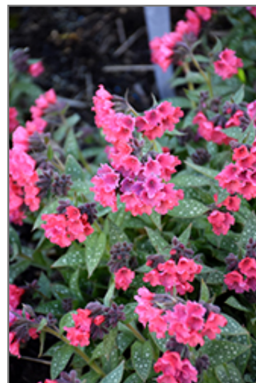
Shrimps On The Barbie Lungwort flowers

Shrimps On The Barbie Lungwort is recommended for the following landscape applications;