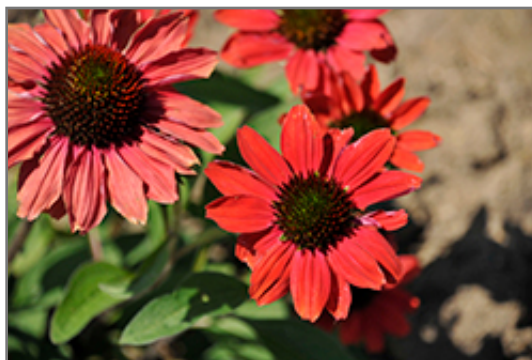
Color Coded Frankly Scarlet Coneflower flowers

Color Coded Frankly Scarlet Coneflower is a fine choice for the garden, but it is also a good selection for planting in outdoor pots and containers. With its upright habit of growth, it is best suited for use as a 'thriller' in the 'spiller-thriller-filler' container combination; plant it near the center of the pot, surrounded by smaller plants and those that spill over the edges. It is even sizeable enough that it can be grown alone in a suitable container. Note that when growing plants in outdoor containers and baskets, they may require more frequent waterings than they would in the yard or garden.