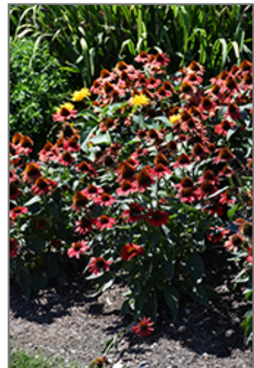
Color Coded Frankly Scarlet Coneflower in bloom