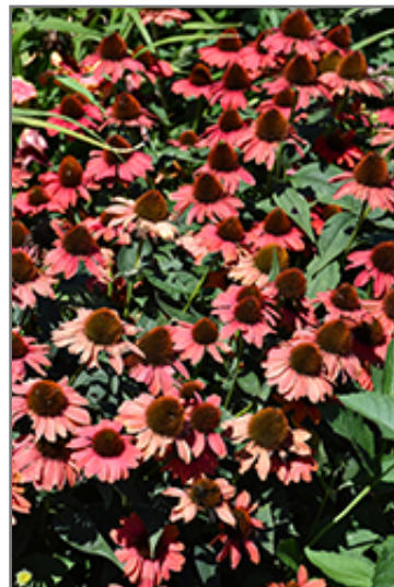
Color Coded Frankly Scarlet Coneflower flowers

This is a relatively low maintenance plant, and is best cleaned up in early spring before it resumes active growth for the season. It is a good choice for attracting bees and butterflies to your yard, but is not particularly attractive to deer who tend to leave it alone in favor of tastier treats. It has no significant negative characteristics.