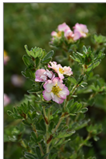
Happy Face Hearts Potentilla flowers