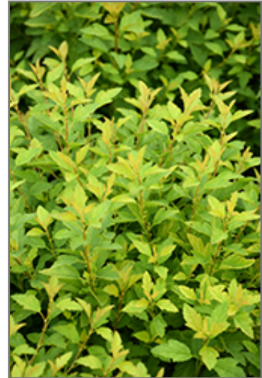
Raspberry Lemonade Ninebark foliage

Raspberry Lemonade Ninebark is recommended for the following landscape applications;