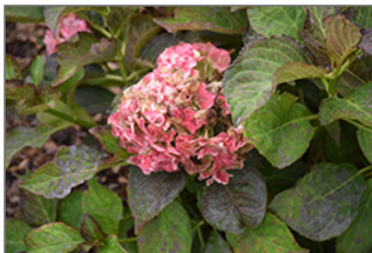
Miss Saori Hydrangea flowers (faded)