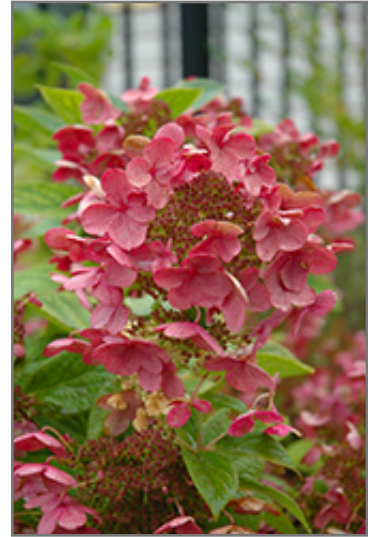
Quick Fire Hydrangea flowers (faded)

This shrub performs well in both full sun and full shade. It prefers to grow in average to moist conditions, and shouldn't be allowed to dry out. It is not particular as to soil type or pH. It is highly tolerant of urban pollution and will even thrive in inner city environments. Consider applying a thick mulch around the root zone in winter to protect it in exposed locations or colder microclimates. This is a selected variety of a species not originally from North America.