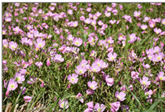
Evening Primrose flowers

This plant should only be grown in full sunlight. It prefers dry to average moisture levels with very well-drained soil, and will often die in standing water. It is considered to be drought-tolerant, and thus makes an ideal choice for a low-water garden or xeriscape application. It is not particular as to soil type or pH. It is somewhat tolerant of urban pollution. This species is native to parts of North America. It can be propagated by division.