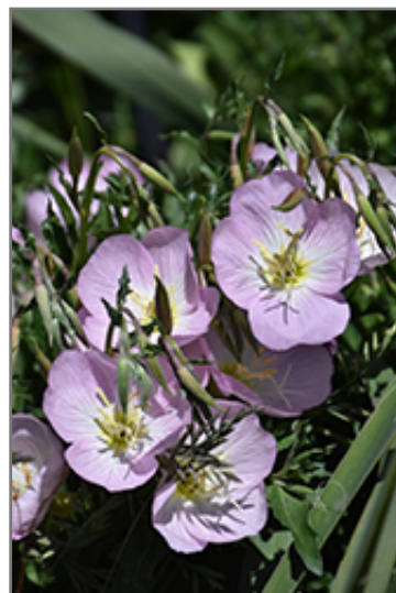
Evening Primrose flowers

Evening Primrose is recommended for the following landscape applications;