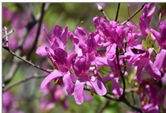
Lilac Lights Azalea flowers