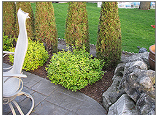
Country Gold Wintercreeper