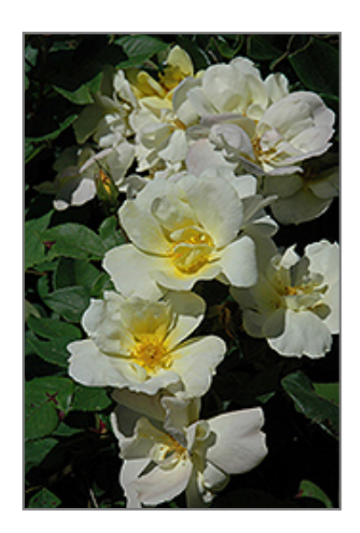
Sunny Knock Out Rose flowers