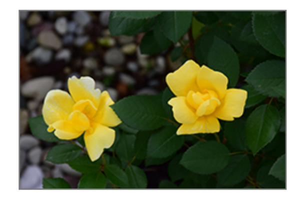
Sunny Knock Out Rose flowers